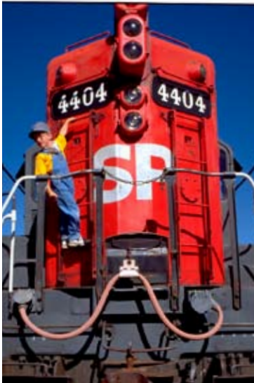
Western Pacific Railroad Museum

Feather River Fitness and Recreation Center is open until 9pm seven nights a week. (530-283-2255) One-day passes are available.