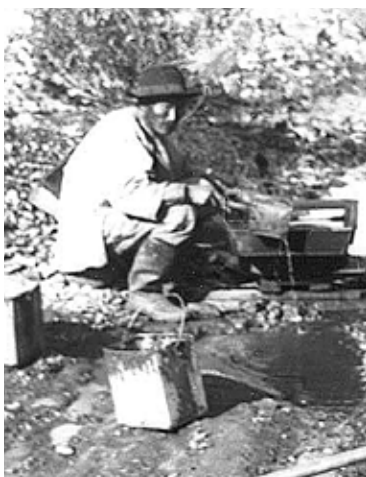
Plumas County's gold attracted many miners.

Explore the history of this Northern Sierra recreational paradise, from Maidu Indians to the Gold Rush, railroading to timber harvesting.