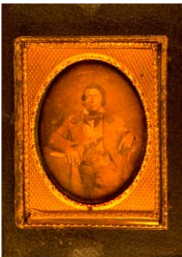
James P. Beckwourth