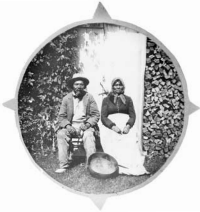
A Mountain Maidu family in 1900

Explore the history of this Northern Sierra recreational paradise, from Maidu Indians to the Gold Rush, railroading to timber harvesting.