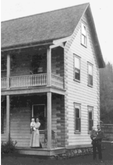
The original Variel Home in Quincy