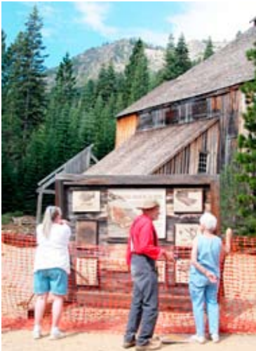
Mohawk Stamp Mill, Plumas-Eureka State Park