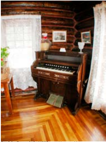
Inside Portola's Williams House Museum

I For more information on this tour, contact the Plumas County Visitors Bureau at 800-326-2247 or visit www.plumascounty.org .