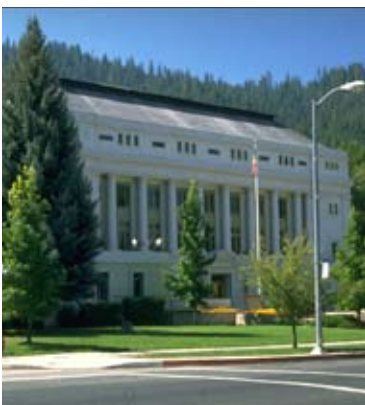
Plumas County Courthouse in Quincy