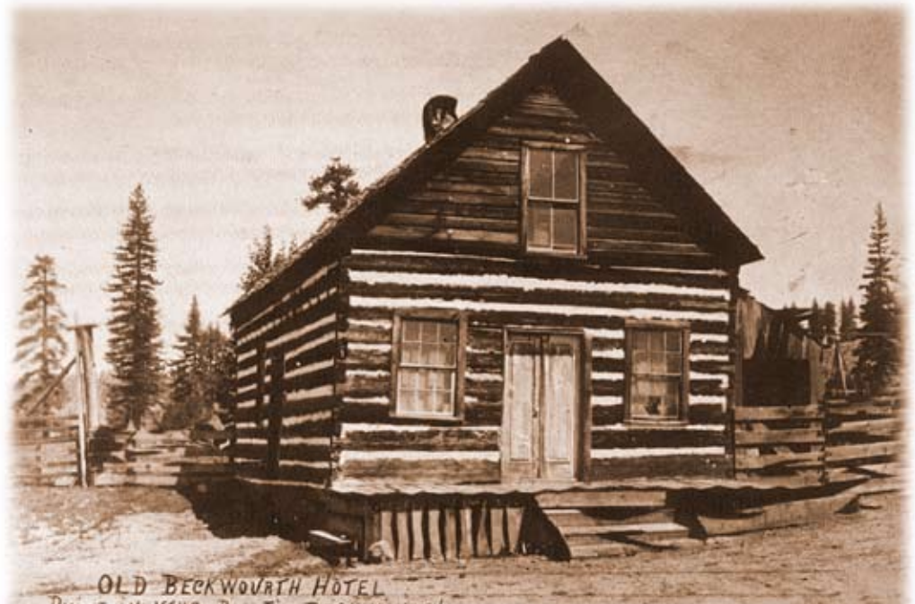
The hotel and trading post built by pioneer Jim Beckwourth was restored and turned into a museum east of Portola.

Rural museums, historic buildings, a state park and auto routes are among the attractions on this three-day glimpse into the origins of Plumas County.